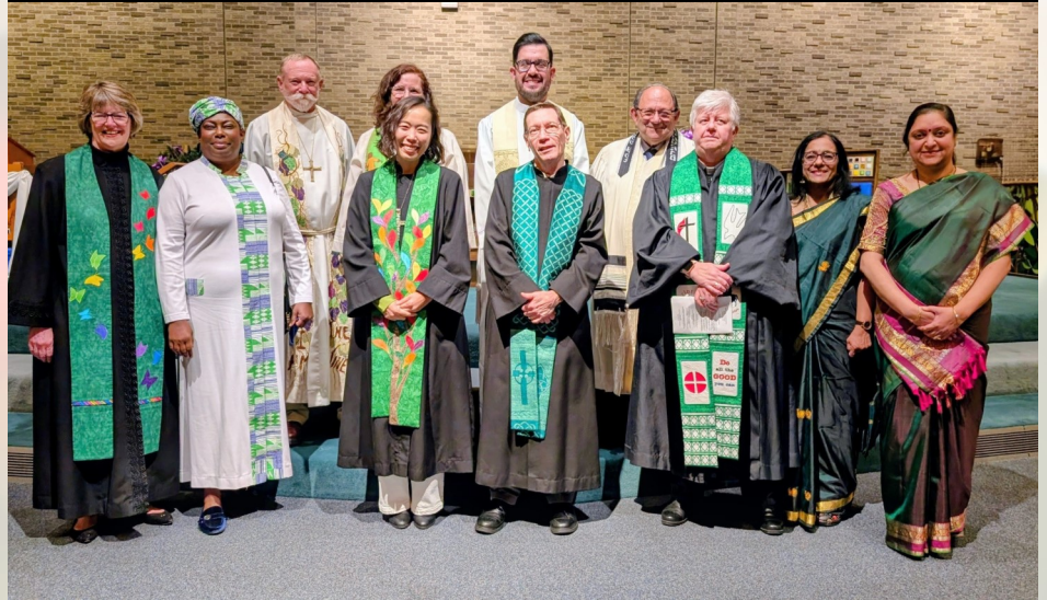
2025 Interfaith Thanksgiving Service